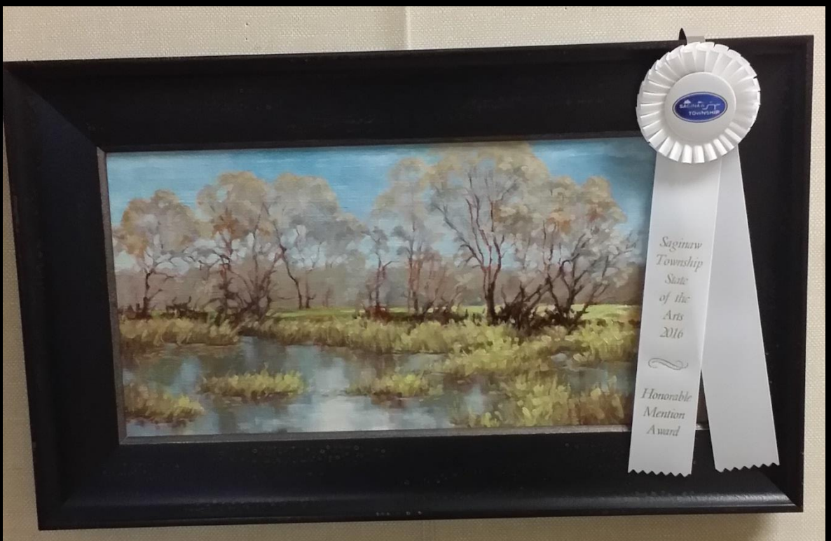
HONORABLE MENTION Priscilla Olson – Midland Icy Spring – oil on linen