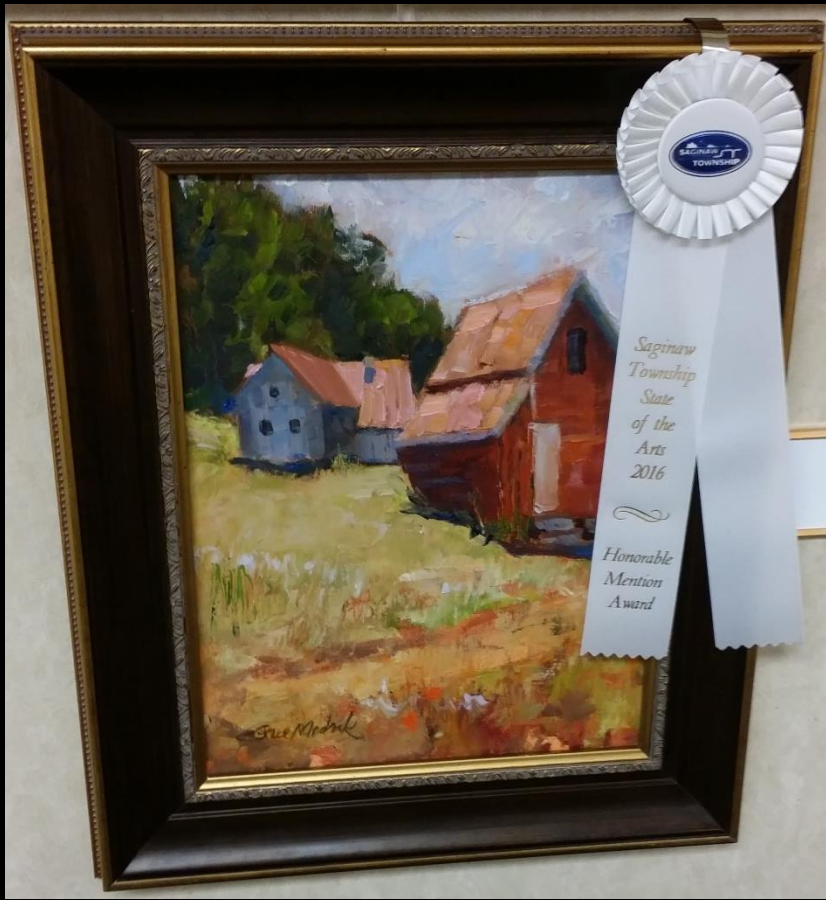
HONORABLE MENTION Sue Modrak – Mt. Morris Barn Study Plein Air – oil