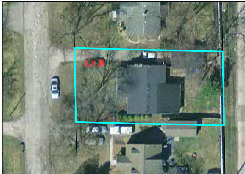
Area Location Map