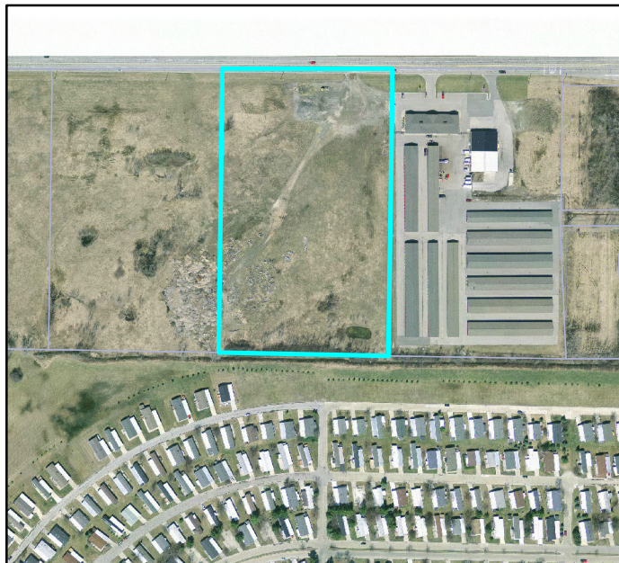
Area Location Map