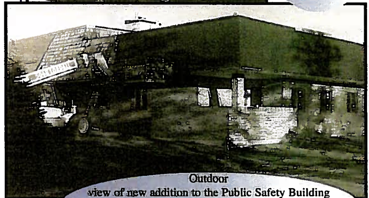
Outdoor view of new addition to the Public Safety Building scheduled for completion in February 2000.

The most celebrated holidays are approaching. Don't let holiday festivities turn into tragedies. Please remember to be fire safe: