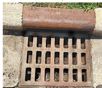
Grate with restriction plate installed.