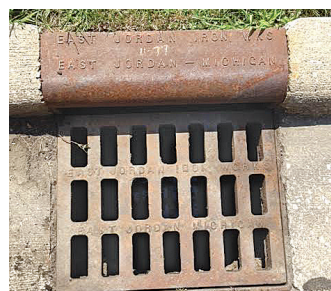
Grate before restriction plate.

Although the ponding of storm water in front of your home or business can sometimes be an inconvenience, it is a sign that the restriction plates are performing correctly. If you notice a missing restriction plate in front of your home or business, please contact the Department of Public Services at 989-791-9870.