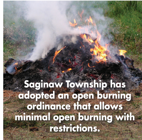
Saginaw Township has adopted an open burning ordinance that allows minimal open burning with restrictions.

al burning or in a pit that does not exceed three feet in diameter and two feet above ground level. Open burning that will be offensive or objectionable to area residents because of smoke or odor emissions when atmospheric conditions or local circumstances make such fires hazardous shall be prohibited and your permit will be revoked.